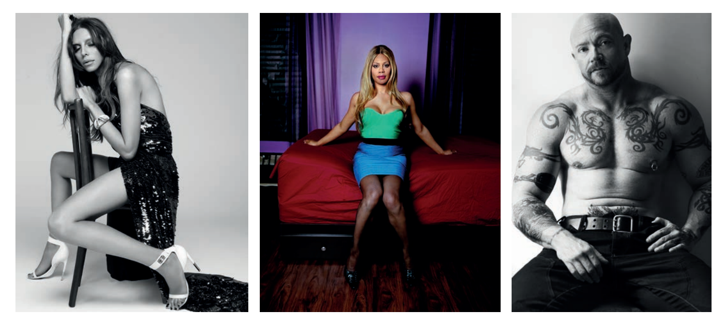
© Léa T Elle Brazil - Fabio Bartelt / Monster Photo

The 2018 program "Transcendence" evokes the overcoming of the separation between the arts, cultures and communities through photography, video and installation testimonies, as well as discourse.